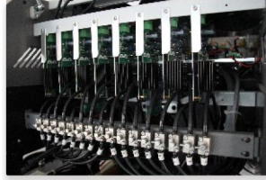
Negative Pressure System