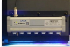
LED UV lamps & Static eliminator