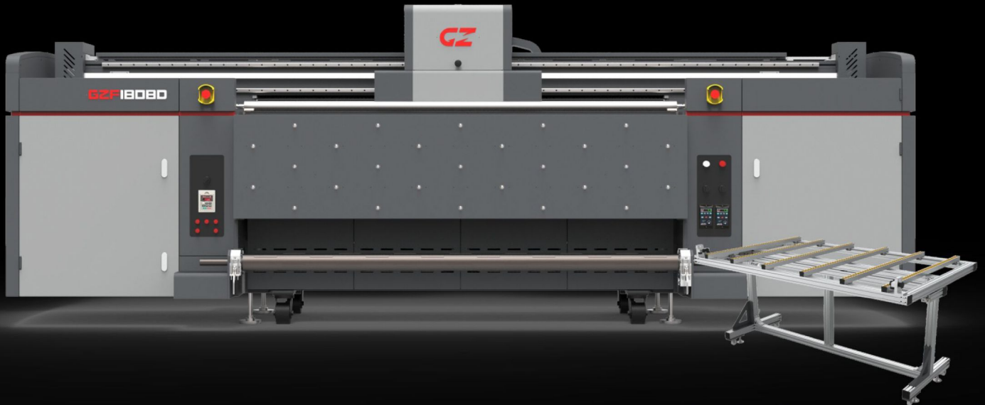
Available with extension table (optional)