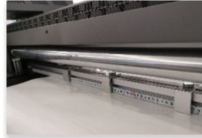
Media alignment bar