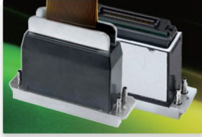
Ricoh Gen5/ Gen6 print heads