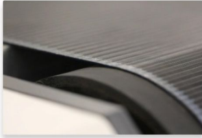
Accurate belt system