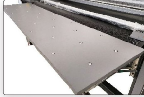
Build-in folding table